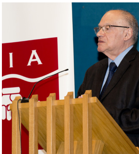
President Emeritus Dr Ugo Mifsud Bonnici

Certificates were handed to graduates and awards were given to those graduates and students who excelled in either their subject or throughout their overall studies during the last twelve months. A reception followed.