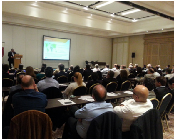
Delegates at the sixth SMP Forum

This full-day event was sub-divided into five sessions including a mix of breakout sessions and presentations. The event hosted a wide array of speakers who delved into topics which are of interest to SMPs including venture capital, credit management, foundations and cooperatives, dismissals in employment law and case-law, anti-money laundering and the professional and crime.