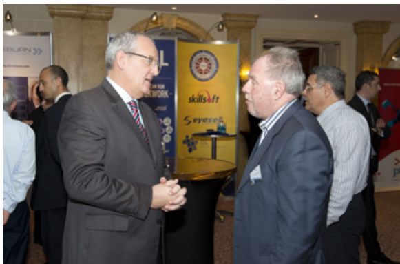
Delegates during the networking break