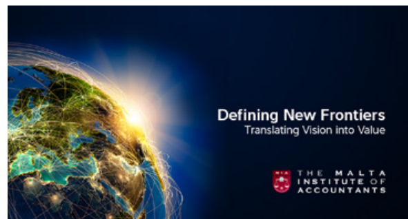
Biennial Conference 2014 Theme

This Conference assumed a particular importance in view of the recent accounting and auditing reforms that have been approved by the EU, which reforms will affect the Maltese business sector profoundly as will other changes in tax, prevention of money laundering and public sector accounting.