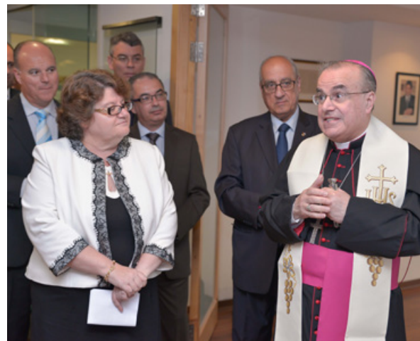
Archbishop Emeritus Paul Cremona during the blessing of the commemorative plaque