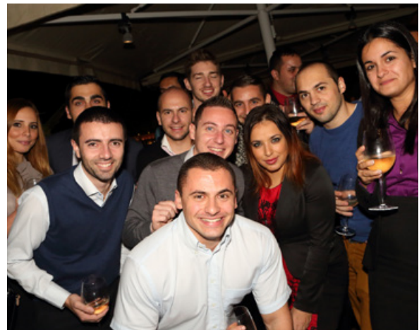
Members during the Christmas Drinks 2014