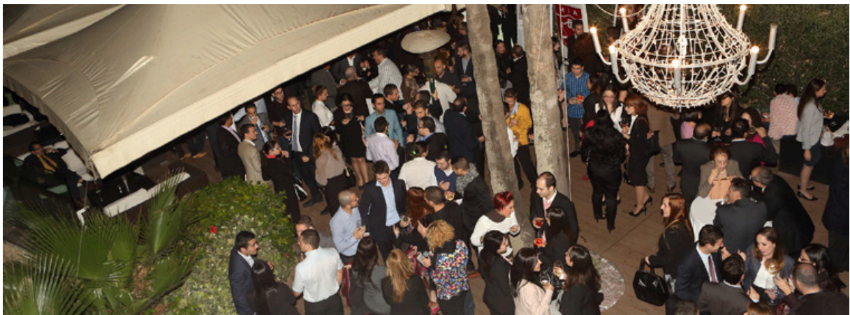
Members during the Christmas Drinks 2014