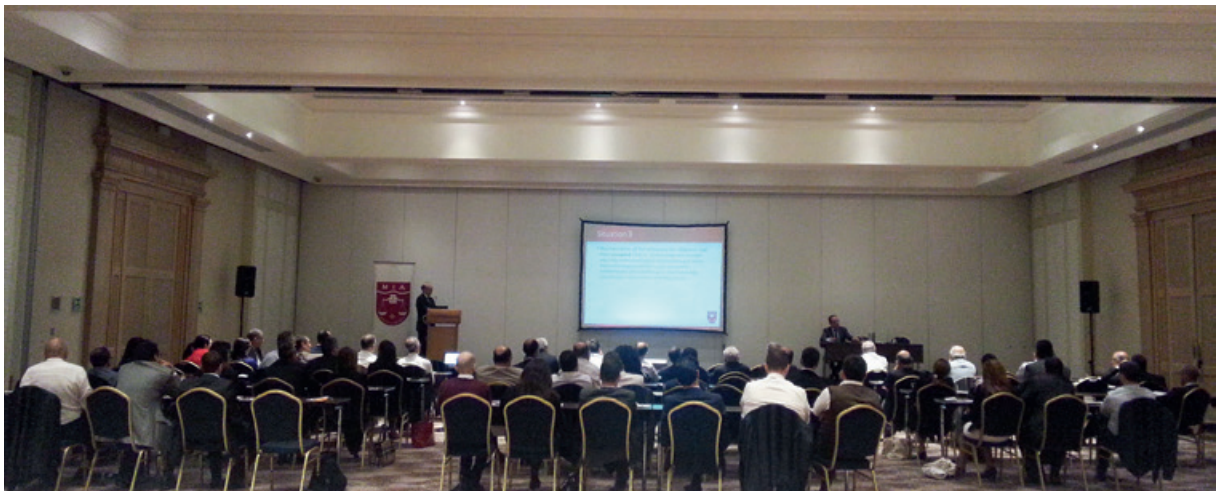
Delegates at the sixth SMP Forum