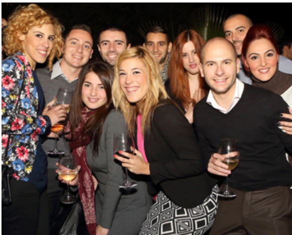
Members during the Christmas Drinks 2014