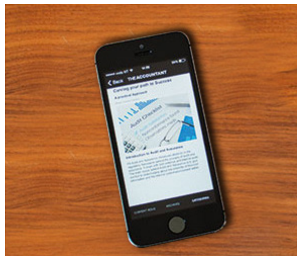
The Accountant smartphone application for IOs and Android

This application allows Members to view news, articles, and views from the Malta Institute of Accountants quarterly journal, the Accountant, on their smartphone and tablet. It offers readers the opportunity to browse each issue of the MIA journal from anywhere, on any device and at any time. The application combines ease of access with a platform for aggregating contributions from the journal such that it will provide readers with one of the best interactive experiences that are available for periodic publications.