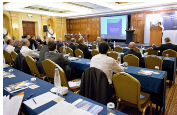
Delegates at the Biennial Conference 2014