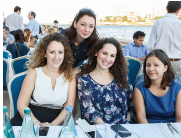
Members during the Social Event 2015